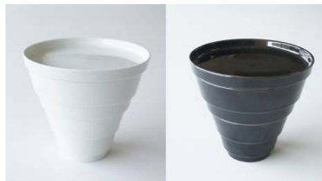
C01 Conic White C02 Conic Black size : φ170×h155mm