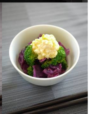
Φ 90×h40mm 150ml