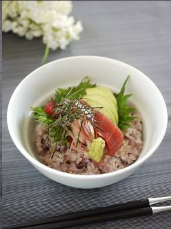
Φ 155×h62mm 600ml