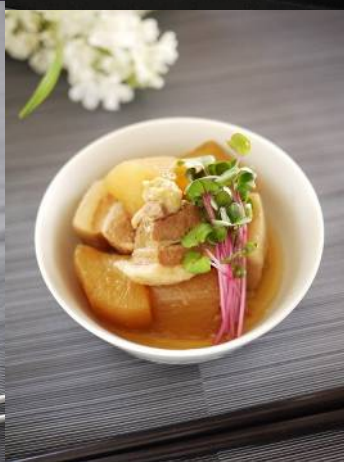
Φ 118×h42mm 250ml